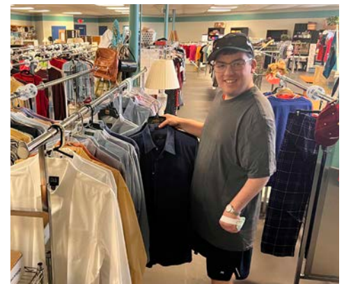
(Above Left) Adding to the furniture display, (Above Center) Accepting clothes in the donation center, (Above Right) Hanging clothes on the showroom floor