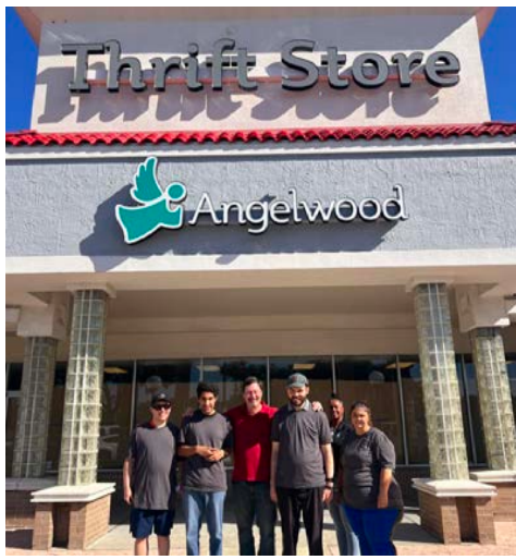
(Above) Supported Employment participants pause to pose with their Job Coach and the Angelwood Thrift Store Manager