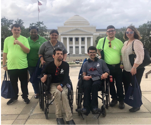
Resident Government visits the State Capital to self-advocate during Florida's Developmental Disabilities Awareness Day.