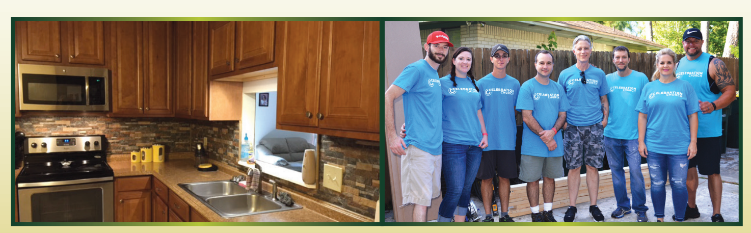
The kitchen got a make over with new cabinets and countertops thanks to a donation of materials from Young American Homes.