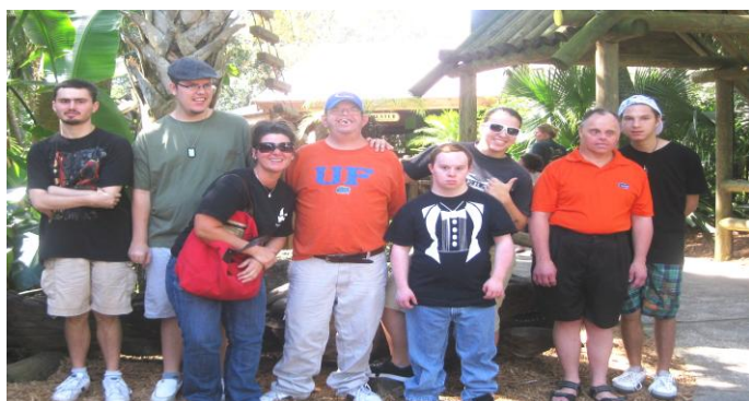
The gentlemen from Sidesaddle at the Alligator Farm