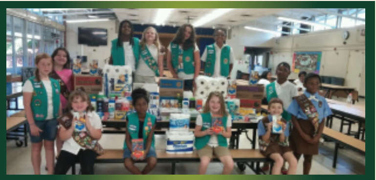
Girl Scout Junior and Brownie Troops pose with all of the items collected during their Angelwood Wish List drive.

The CSX Charity Train Ride raised a record $91,000.00 for Angelwood. While some of the funds will support capital and general needs, this money is primarily used to help our Summer Day Camp possible. We are very grateful for the efforts of everyone involved with the CSX Charity Train Ride.